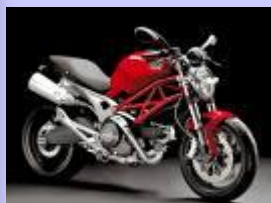
Ducati 696 Monster. Low and very light

fairly heavy but the weight is low and it could make a good 'first bike' when moving up to a large machine. In general however, Triumph do not seem to have adopted the attitude that the shorter rider is worth courting as a customer, unless they want a Cruiser.