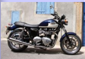
Triumph Bonneville—a seat height friendly to little legs.

The Bellagio is a cruiser with a low seat but without the full on, feet in front styling. If you have a dealer near you, Guzzis are well worth a look for something different and I am told are rather fashionable with younger riders at present.