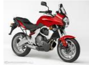
Kawasaki Versys—lower gel seat option may help, but not for the very short.

+20mm narrower) - ZZR1400 (800mm standard, reduced as above = 775mm) Versys -(845mm standard, we looked at this and even with a gel seat, it was too tall for us to test ride. ER6N (up to 08 model) (785 standard, lowered to 765mm + 30mm narrower) ER6F (up to 08 model) 790mm standard reduced to 770mm + 30mm narrower. Gel seats cost between £186.95 & £280.95 inc VAT