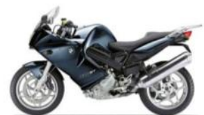
BMW F800 ST—one of the few all round bikes a short person could walk into a showroom and test ride, thanks to it's low seat.

BMW are quite simply streets ahead of any other manufacturer in catering for shorter riders or simply those who prefer to be able to get their feet flat on the floor.