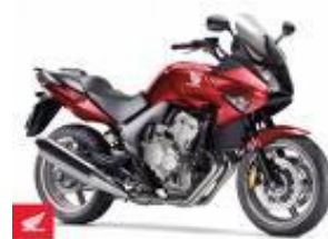
Honda CBF600 SA