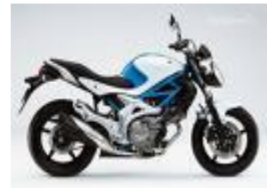
The new Suzuki Gladius. Entry level, low and light

offset this, depending upon your body configuration! A commuter/tourer option might be the V Strom, which can successfully have the seat carved (or a gel seat made) bringing it down to 790 or 800mm, while those fancying a large capacity Cruiser will find all models have low seats. The new Gladius is designed as an entry level bike, basic, reasonably priced, low (785 mm seat), narrow and light.