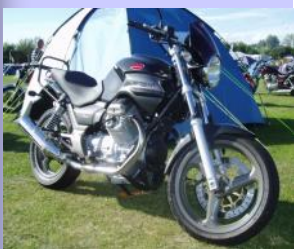
Moto Guzzi Brevia 750 ...user friendly, easy bike to ride, which would make it an excellent entry option...